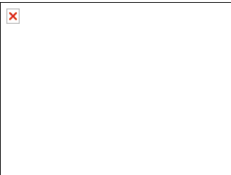
Bruce Hutchis serves locals and visitors his "world famous" chowder and seafood at the Caves Restaurant, located on the beach, in St. Martins.

For the crowd of visitors coming for a lunch of soup and clams or lobster, eating at the Caves, just steps from the Bay of Fundy, makes the food taste even better, and at the small harbor nearby the air smells of fish and salt, the pier littered with wooden lobster traps and pieces of fish bait, and visitors stroll into the half-dozen antique shops, all located within small, weathered, clapboard houses.