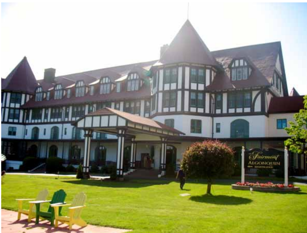
The Fairmont Algonquin

Canada's first seaside resort town, St. Andrews by-the-Sea, NB, has many claims to fame: it's by the ocean; it blends historic with modern; there's a lot to do, especially if you love the outdoors; and its grand dame hotel lets you slow down and enjoy life.